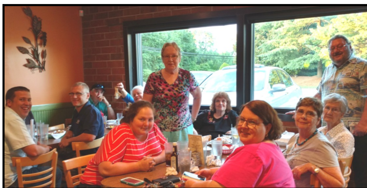
- Sardis Night at the Americana - The entire crowd could not fit in the picture!