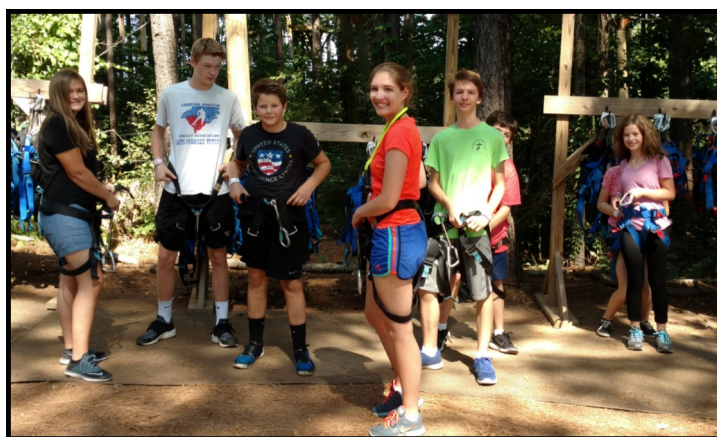
Sardis Youth at the US National Whitewater Center