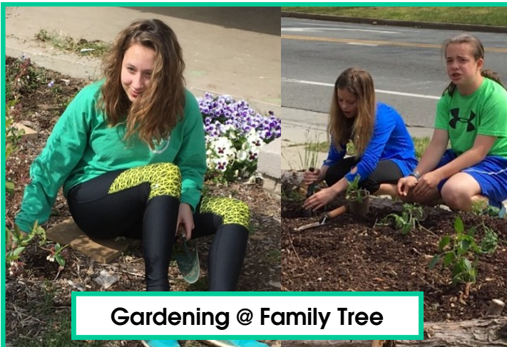
Gardening @ Family Tree