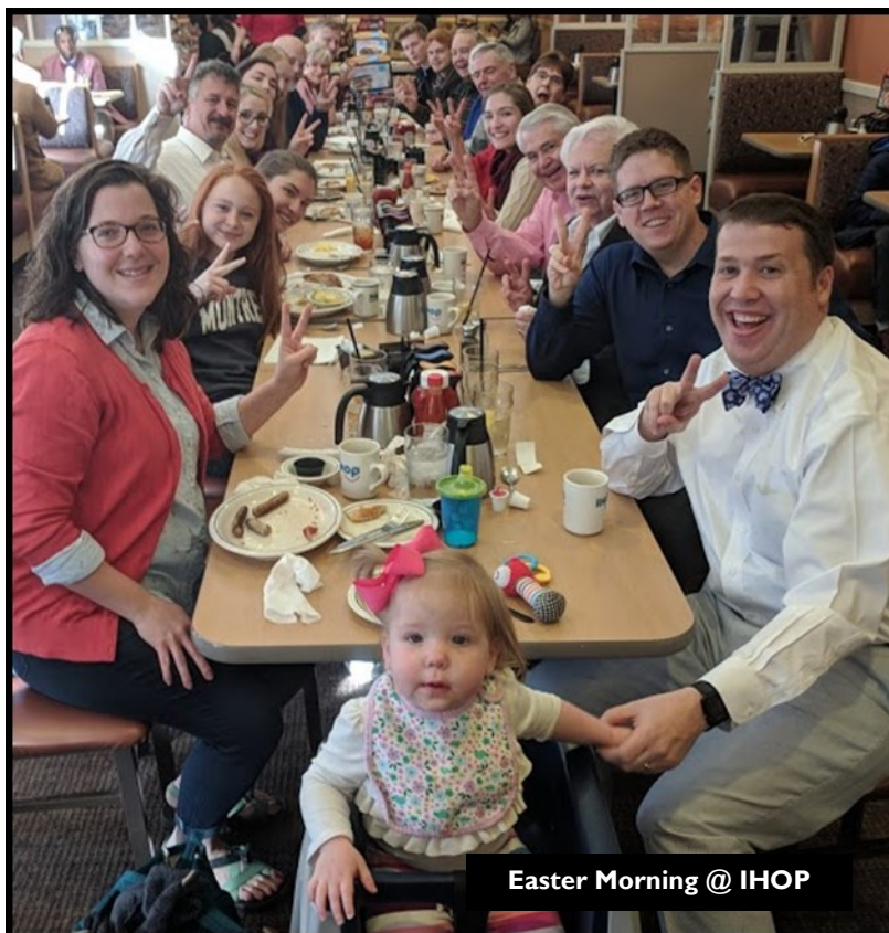
Easter Morning @ IHOP