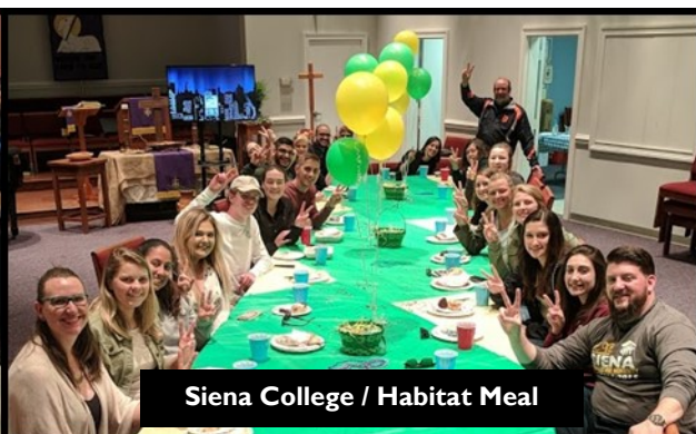
Siena College / Habitat Meal