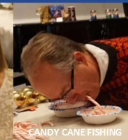
CANDY CANE FISHING