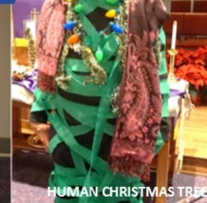
HUMAN CHRISTMAS TREE