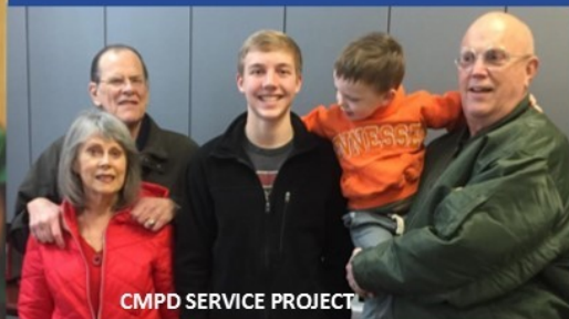
CMPD SERVICE PROJECT