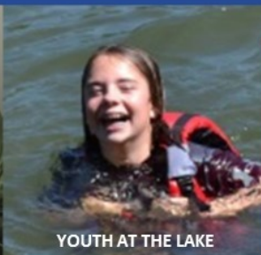
YOUTH AT THE LAKE