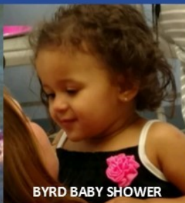
BYRD BABY SHOWER