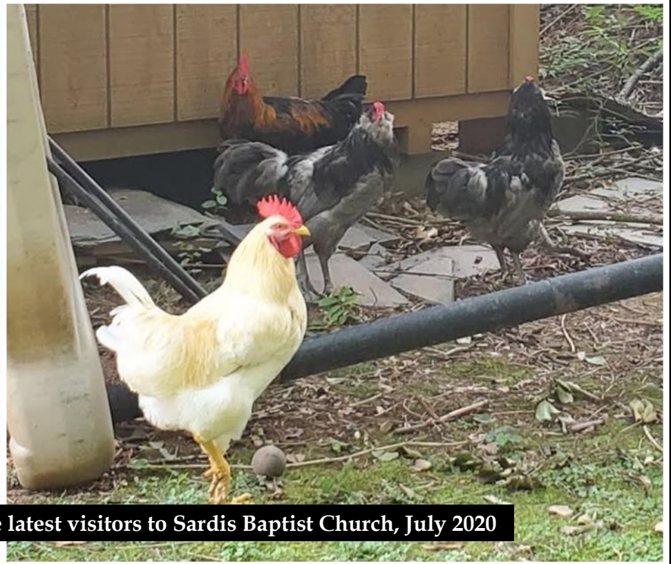
Introducing the latest visitors to Sardis Baptist Church, July 2020