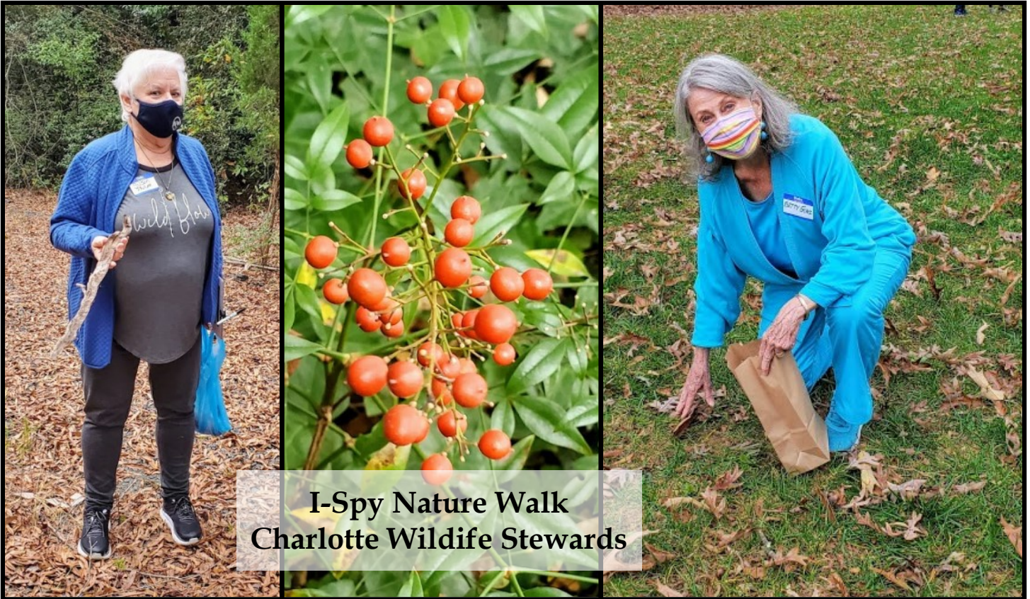
I-Spy Nature Walk Charlotte Wildlife Stewards