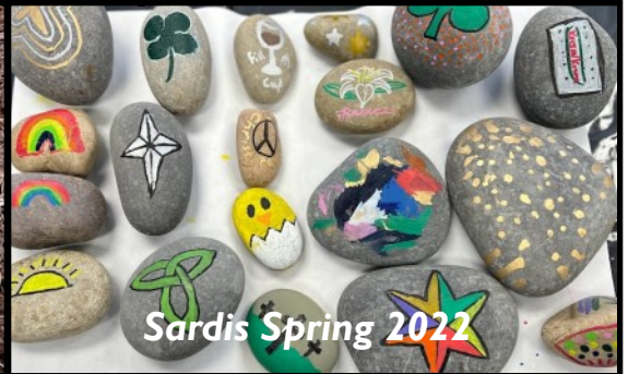
Sardis Spring 2022