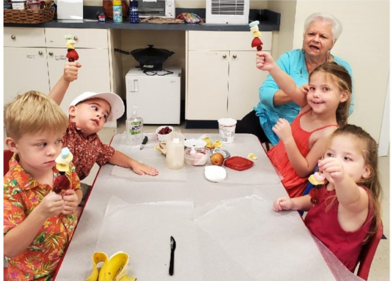
Wit, Wisdom, and Discovery Worship Care — July 24th, 2022 See page 5 for more details.