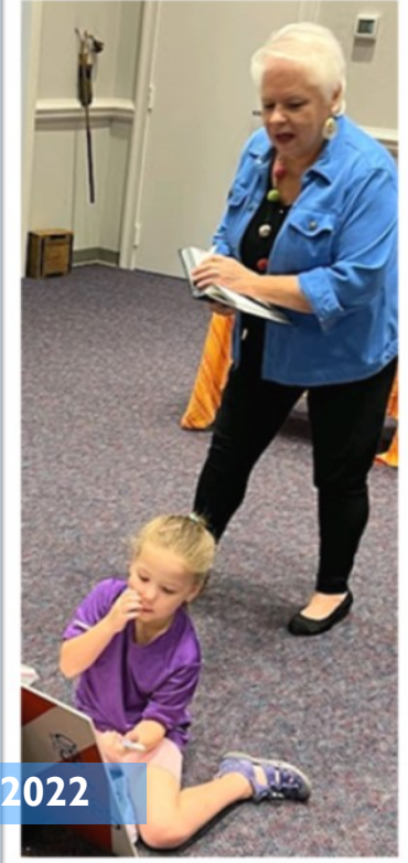
Welcome to Worship Class ~ September 2022